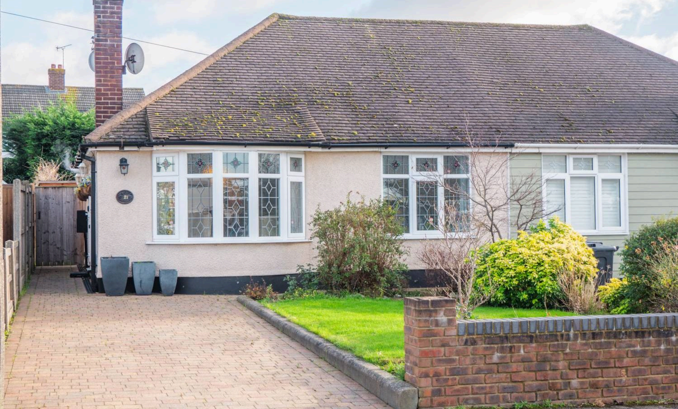
21 Clyde Crescent, Rayleigh Rayleigh