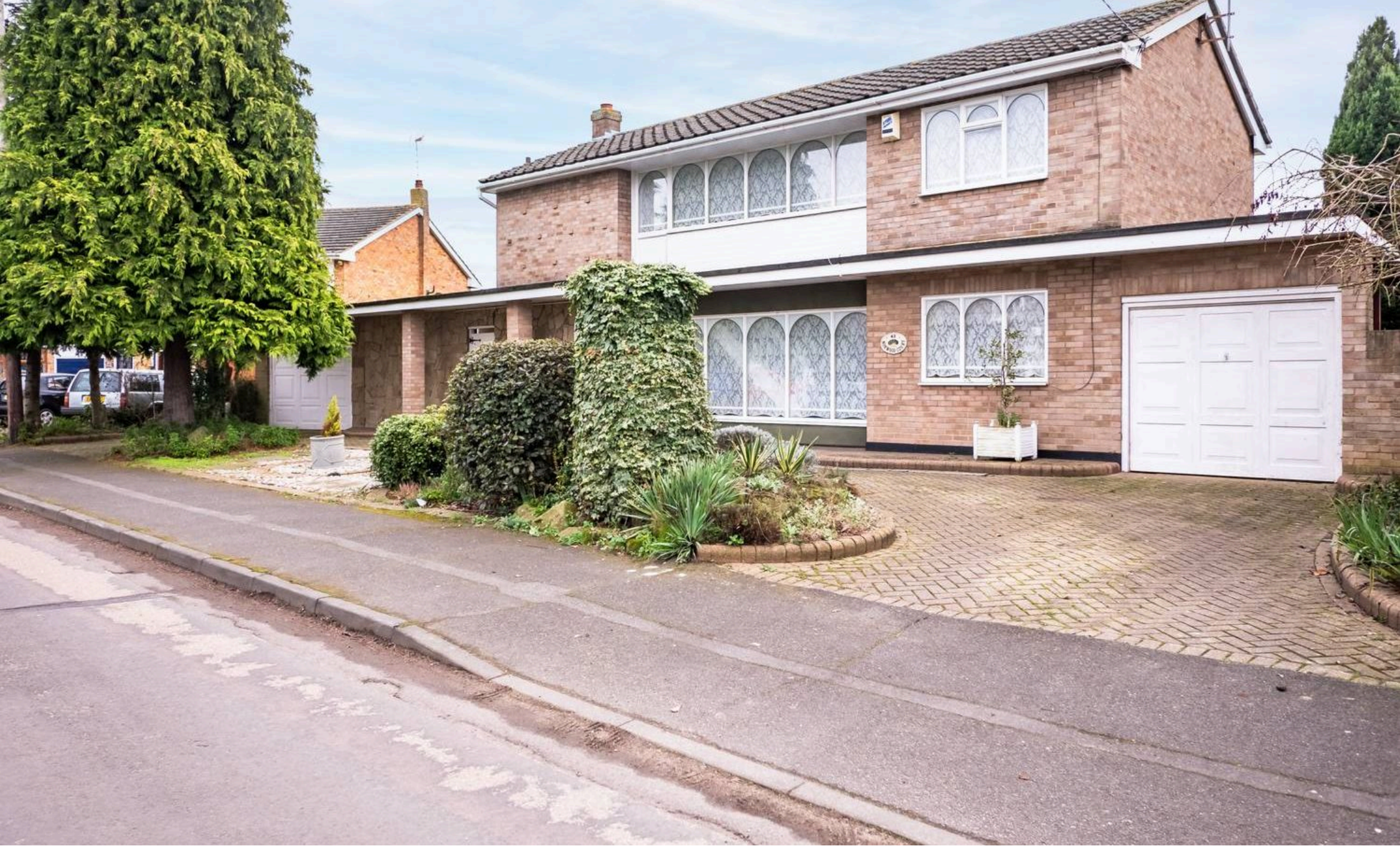
42 Rayleigh Avenue, Leigh-On-Sea Leigh-On-Sea