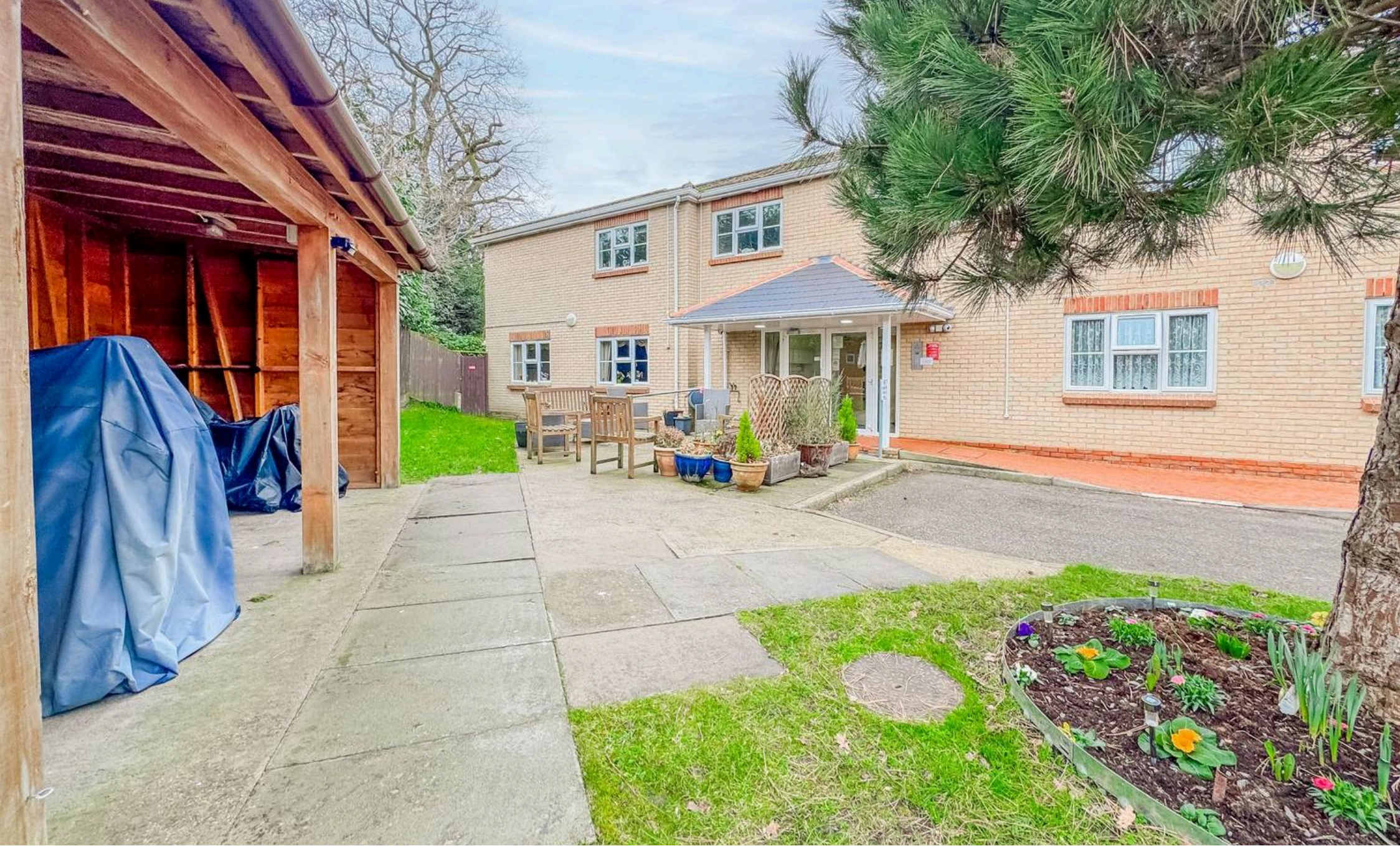
Flat 12, Oak Lodge, 21 Southend Road Hockley