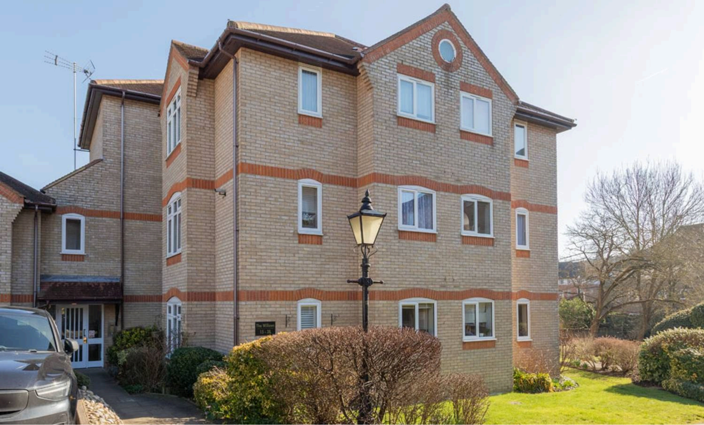
15 The Dell, Colchester Colchester