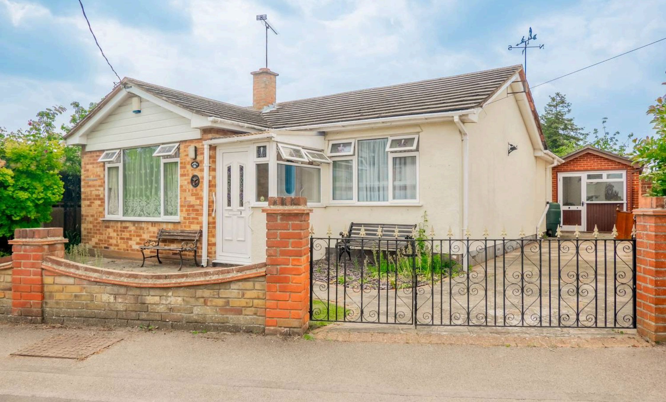
4a Hillside Avenue, Hockley Hockley