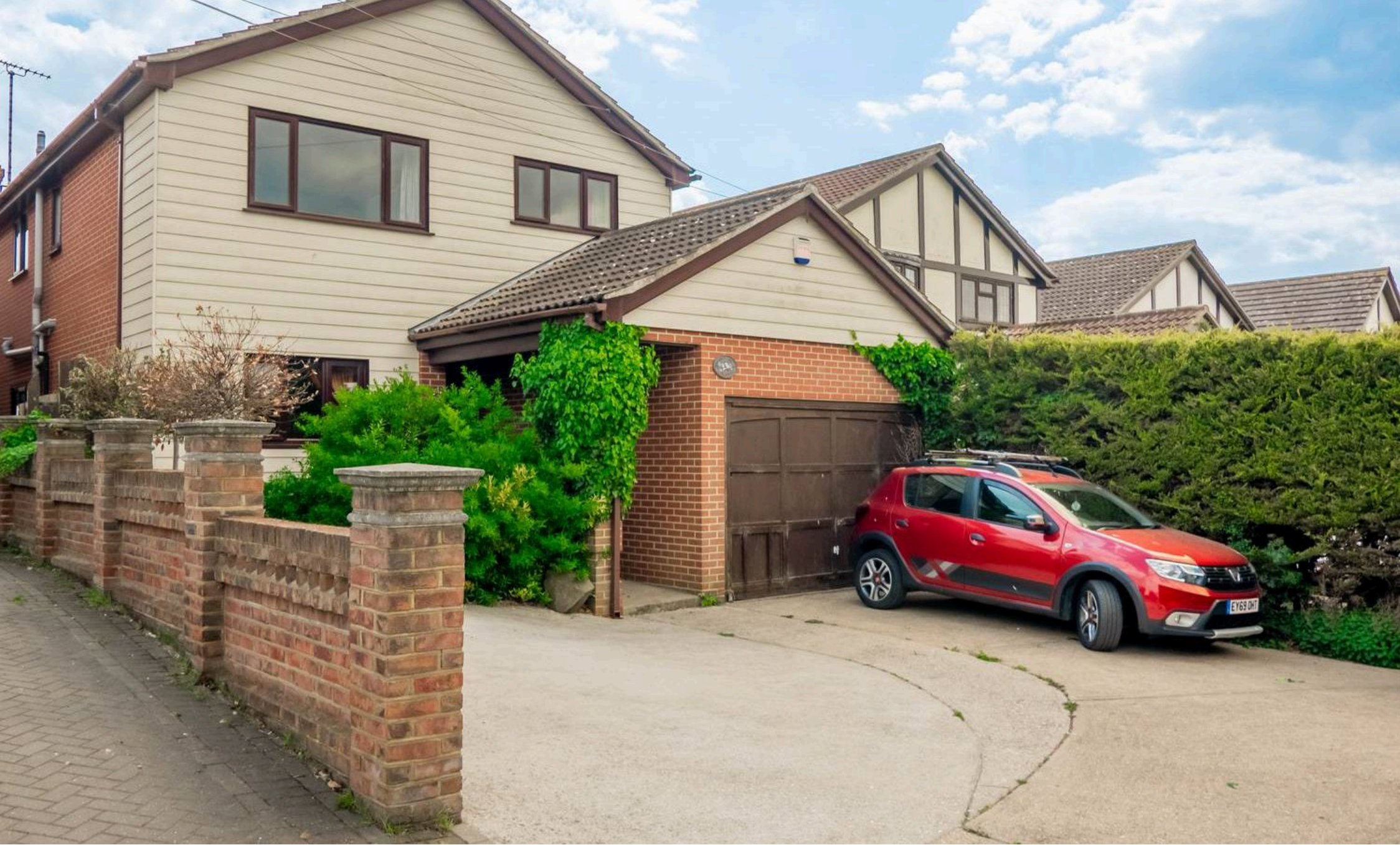
98 Lower Road, Hullbridge Hockley