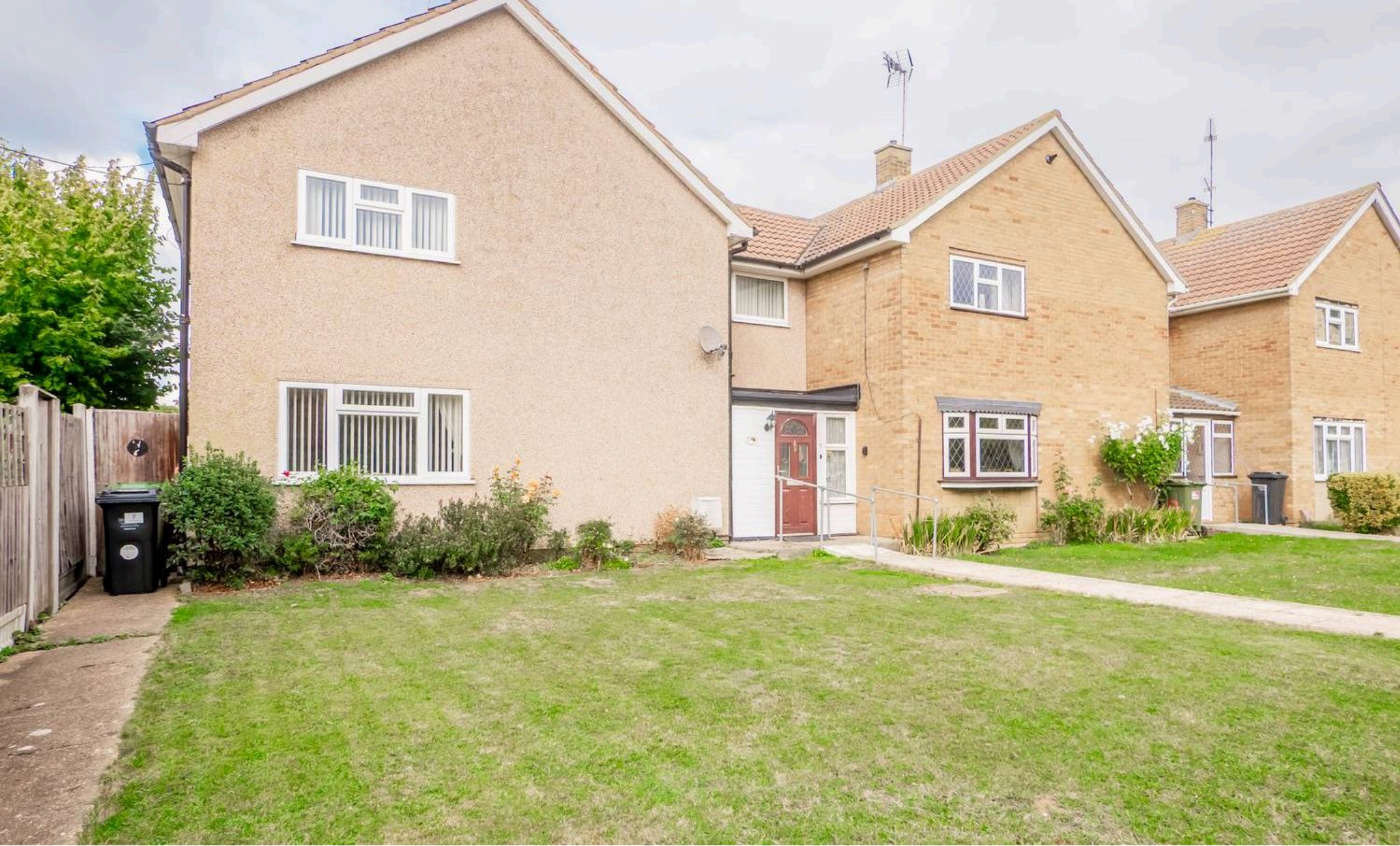
7 Falkenham Path, Basildon Basildon