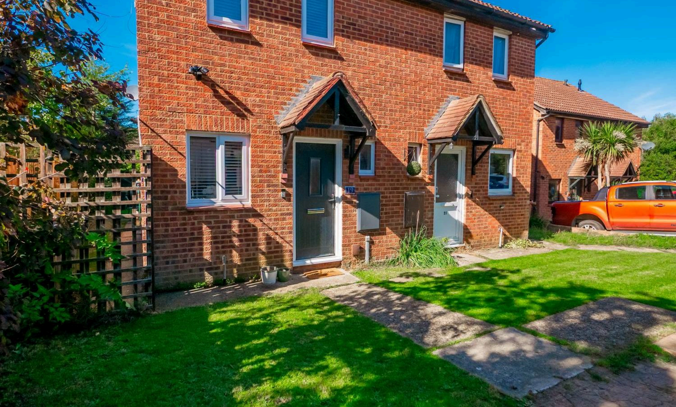
19 Woodstock Crescent, Hockley Hockley